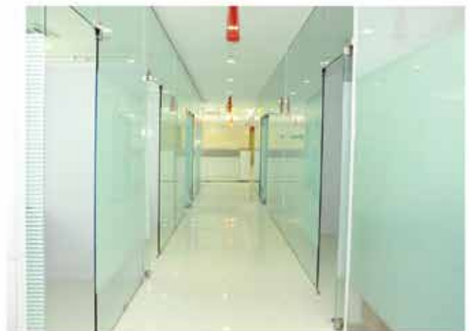
Senior Management and Directors Offices