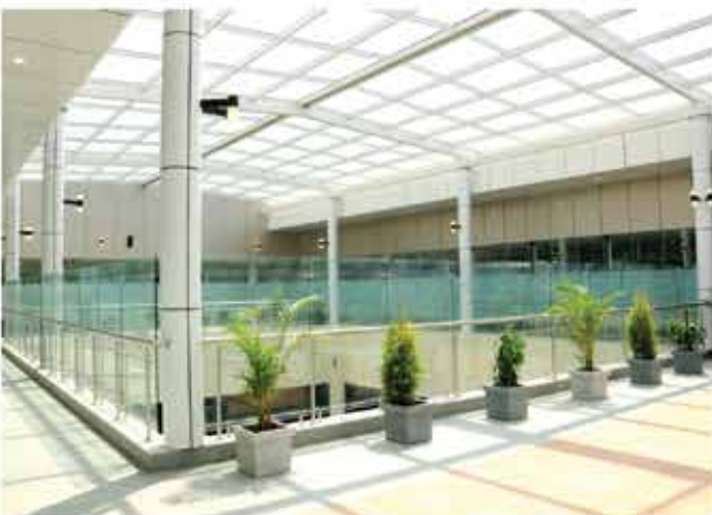
Time off Area